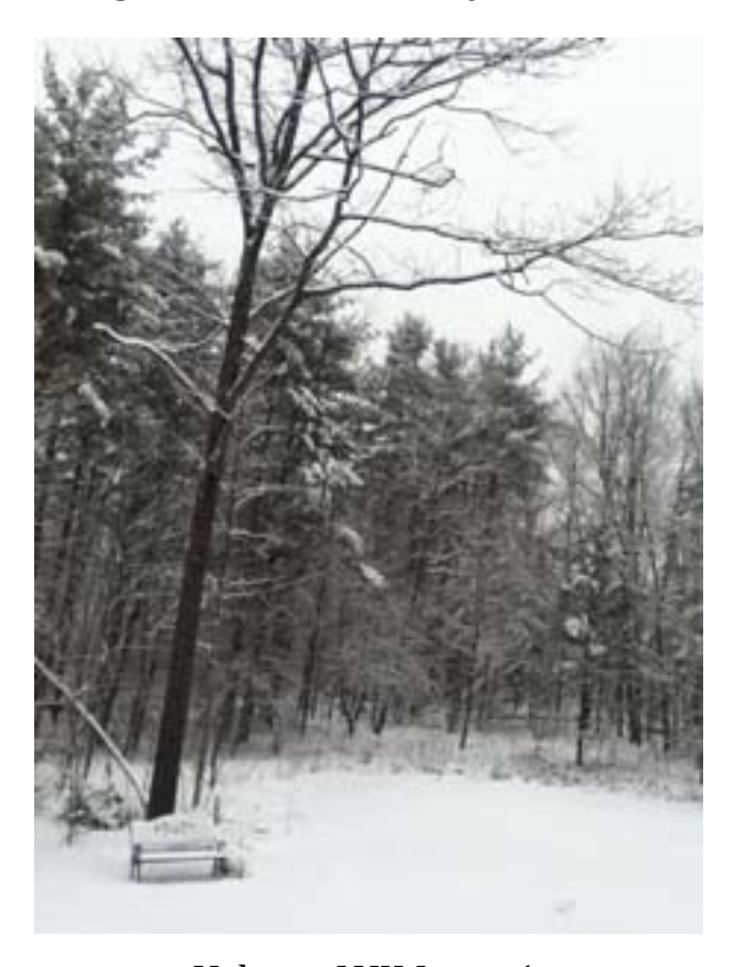
Volume LVII Issue 1

A magazine for the literary and visual arts