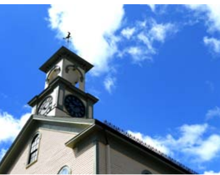
Still Peace Peter Georgacouloua

Dreams of inconsistent scenery blurring and meshing, a backdrop of color, white puffs hanging in a sea of blue, and sounds that hang in virgin ears. Fantasies about dials turned all the way up. hardly being able to hear over screams of laughter, bones shivering with freedom by day and growing frigid by night. Minds conceiving thoughts of breathless endeavors through mountains and landmarks, auras of wonder lightly dusting everything pictured from the open windows. Reveries filled to the brim with clear lakes and vast oceans. breathing in stale air ripe with freshness and vitality, along with admirable strangers becoming the cast of thoughts and giving a new adventure.