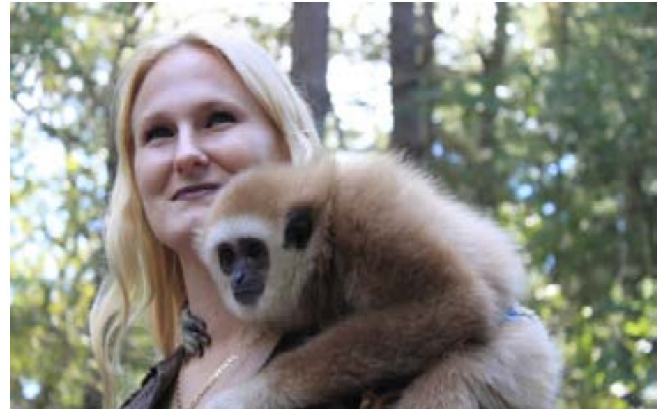
Woman with Monkey

To be a good leader, one must simply influence others in a positive way. One does this through character, service, and vision. Plain and simple, are society lacks good, effective leadership. It's time for a change. Just going through life and being influenced by others is the norm these days. Instead, be the reason that people change! Be a leader! Prove to others that following is no longer enough. If we all become leaders, we will change this country, and this world, for the better.