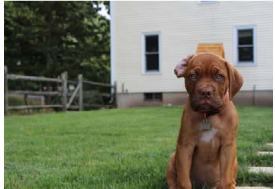
Photo of Dog

But this is how we see him now, the strangers and I. He is only information on a computer screen.