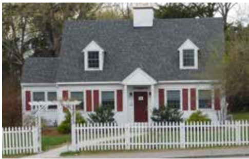
The Mackenzie House, 8 Pinkerton Street, 2021.