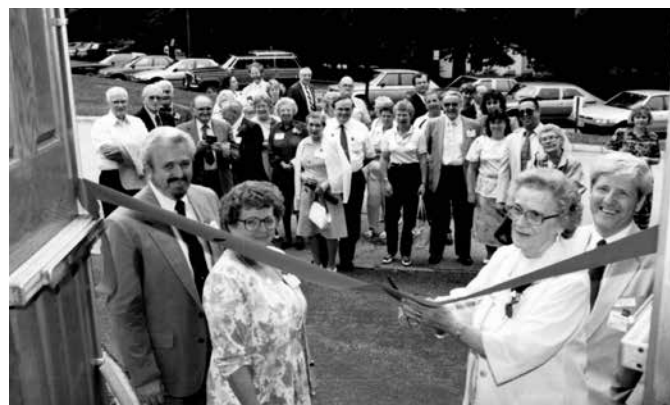
Dedication of the Alumni Center; June 23, 1984.