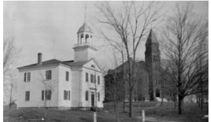
The Old Academy Building after being moved in 1885, dating probably to ca. 1900. From the collections of the Derry Museum of History.

Street, the Old Academy Building has proudly stood for 136 years in the shadow of the Pinkerton Building (later renamed Pinkerton Hall), like the proverbial cat with nine lives, continually being revived. The building is still going strong today, though currently in need of some attention.