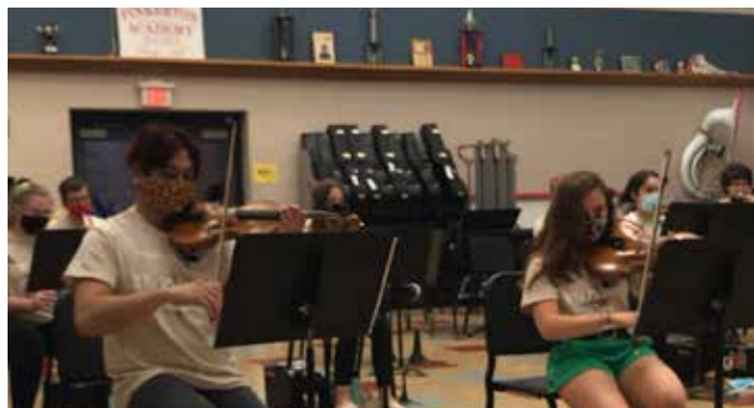
Violinists in the pit orchestra play the fast-paced melody of "Modern Major General."