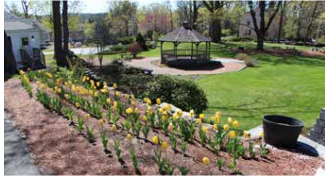
The Hope Garden lines the Memorial Garden on the Pinkerton campus.