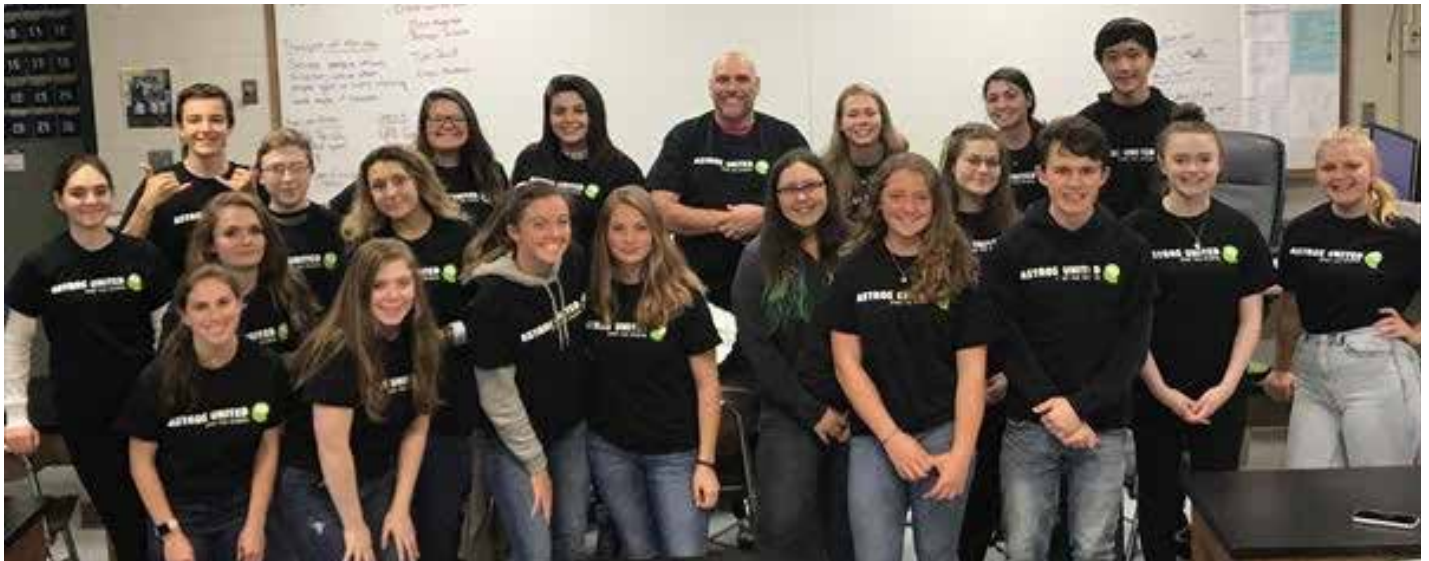
ABOVE: Astros United club members promote conversation and awareness in order to work to stop the stigma associated with mental health.