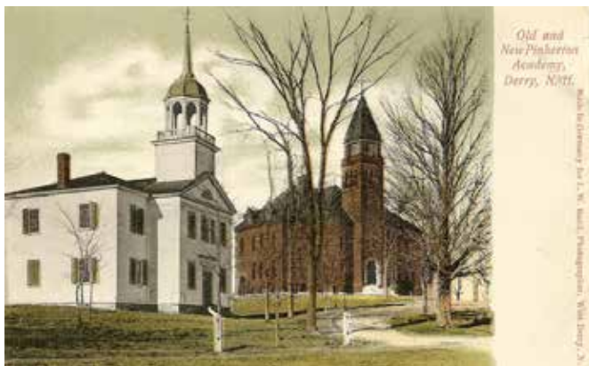
The Old and the New. Postcard from the collections of the Pinkerton Academy Alumni Association archives.

One of the areas first settled by the original Scots Irish migrants to the Nutfield Grant in 1719 (John Pinkerton, father of the school's founders, arrived from Northern Ireland just a few years later), Londonderry's Lower Village, or Derry Village after 1827, enjoyed a building boom with the coming of the Londonderry Turnpike, incorporated in 1804. The architecture of the Village today abounds with structures surviving from the eighteenth and especially nineteenth centuries. Pinkerton Academy, its own location influenced by the siting of the turnpike, owns some of these nineteenth-century structures. The most significant one is, of course, its first schoolhouse—the Old Academy Building, erected in 1815. Since the first of three main principles embraced by the Academy in the 1990s is that “The school’s future is built around the strengths of its history and traditions”, the current Board of Trustees is taking important measures to preserve and present the school’s history. The juxtaposition of the old and the new has been a major mantra of the school since at least 1887.