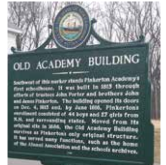
Historic marker installed on the lawn of the Stearns House, autumn 2020.

Society in 1979: the Old Academy Building, and its successor, the 1887 Pinkerton Hall (which might be next in line for nomination to the state register?).