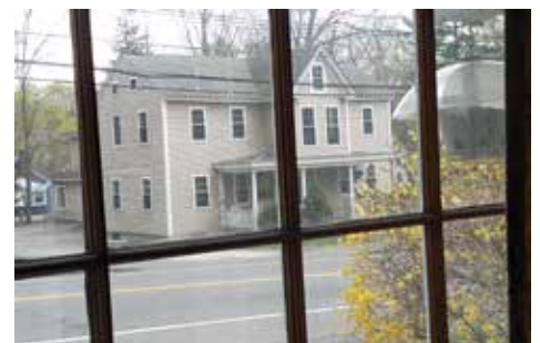
The Bell Cottage or Bingham House, 13 North Main Street, 2021.

The two most historical homes saved and repurposed by the Academy are the Bell Cottage or Bingham House and the Mackenzie House. The former sits adjacent to the now empty Littell lot, on the north