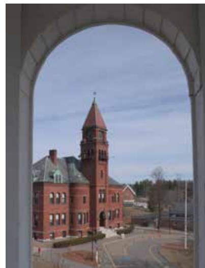
View to the east from the Old Academy Building's bell tower, 2021.