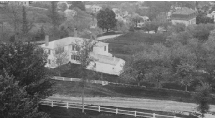
View of Derry Village before 1925, looking south from the bell tower of the new Pinkerton Building, erected in 1887. The Haynes House is in the left foreground; the Bingham House is to the left of Association Hall (the three-story building with the mansard roof).

One of the areas first settled by the original Scots Irish migrants to the Nutfield Grant in 1719 (John Pinkerton, father of the school's founders, arrived from Northern Ireland just a few years later), Londonderry's Lower Village, or Derry Village after 1827, enjoyed a building boom with the coming of the Londonderry Turnpike, incorporated in 1804. The architecture of the Village today abounds with structures surviving from the eighteenth and especially nineteenth centuries. Pinkerton Academy, its own location influenced by the siting of the turnpike, owns some of these nineteenth-century structures. The most significant one is, of course, its first schoolhouse—the Old Academy Building, erected in 1815. Since the first of three main principles embraced by the Academy in the 1990s is that “The school’s future is built around the strengths of its history and traditions”, the current Board of Trustees is taking important measures to preserve and present the school’s history. The juxtaposition of the old and the new has been a major mantra of the school since at least 1887.