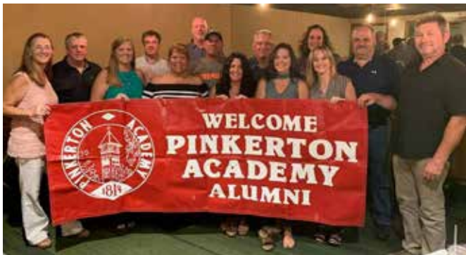
Class of 1984 celebrates their 35th Reunion

classmates working in the education field and continuing to care for their students during these difficult months.