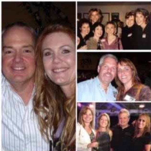
Classmates from previous 1985 reunion