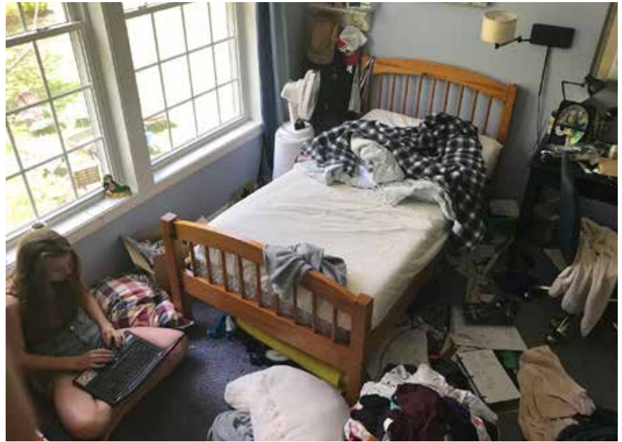
Finding a space for remote learning meant many students attended school in their bedrooms.

While it's true that some classes, such as gym and chemistry were not really compatible with an online learning format, a lot of students saw their grades rise during the quarters spent attending classes at home. While it is important to acknowledge the fact that the online environment provided