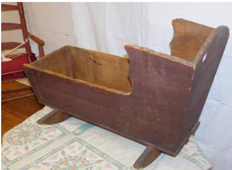
Figure 2. Side view of the Major John Pinkerton Cradle, showing two embellishments: the scalloped edges of the rising sides, and the original exterior painting to resemble a more expensive wood such as mahogany. The rockers were probably replacements for the originals. The cataloging sticker "101" on the back was attached by the DAR in 2002. The James Pinkerton Rocker can be glimpsed in the background.

Although we do not yet know what happened to the Pinkerton Cradle from 1754 to 1902 (a gap slightly longer than the 18 1/2 minutes on Richard Nixon's 1972 Oval Office tapes), thanks to the Molly Reid Chapter's early historian, Harriet Chase Newell, we can trace its existence, in less-than-ideal storage conditions, from 1902 until 1936. The chapter's growing artifacts collection was first stored in rented rooms over the East Derry Store, during which the cradle was exhibited to the public at Derry's Old Home Day celebration in August 1902. Afterward, the 150+ items were moved about Derry Village: first above Charles Bartlett's store on North Main Street; then to a third-floor room in Rev. Lucien H.